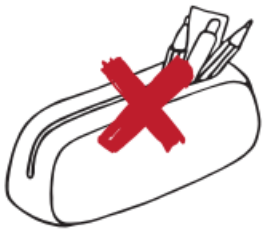
Pencil cases or calculator cases