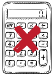
Calculators, except for exam papers where calculators are allowed