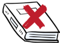
Dictionaries, except for exam papers where dictionaries are allowed