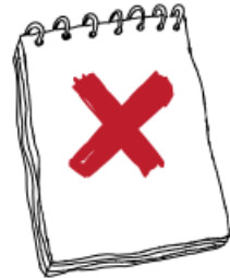
Extra information - books, notes, sketches or paper, and anything written on your clothes or body